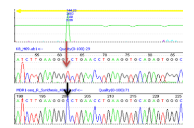
Figure (1): Electrograph shows DNA Sequencing for left wild type; middle Homozygous mt/mt and right Heterozygous wt/mt. Black arrow represented references MDR1 (wild type) and red arrow was the sample.