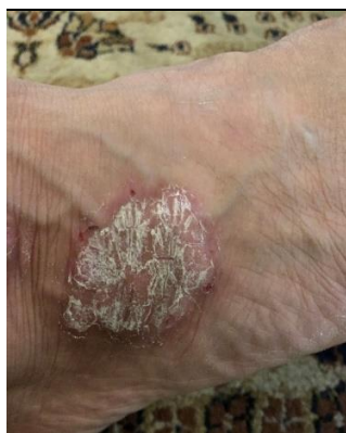
Figure (3): Patient with mild psoriasis.

Estimation of IL-18 concentration had shown an elevation in its mean value among psoriasis patients ( 34.90 \pm 0.79 ) pg/ml, in comparison with the healthy control group ( 19.64 \pm 0.38 ) pg/ml, ( P \leq 0.01 ).