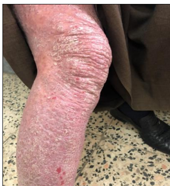
Figure (2): Patient with sever psoriasis.

the differentiation of naïve CD4+ T cells into helper T cells (Th17) (15). From the present results, in some patients with severe psoriasis, (Almost all of their bodies) as shown in figure (2), a significant increase in the level of IL-17 (78.275-72.676-71.784) pg/ml compared with patients with mild-to-moderate ones (Different parts of their body) as shown in figure (3) which are (55.528-39.443-27.342) pg/ml. And that agreement with (16), who indicated the increasing level of IL-17 in psoriatic patients. According to the severity of psoriasis, and supports the search that referred for the severity of the disease was associated with high levels of interleukin-17 compared to patients with moderate or mild severity with statistically significant high difference ( p \leq 0.01 )(17).