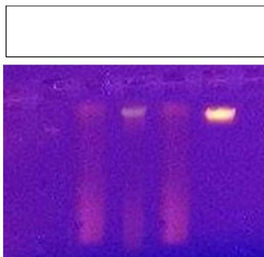
Figure (2): Enlarged image, (a) DNA from control treated with MSPI and HPaII , (b) DNA from breast cancer treated with MSPI and HPaII

enzymes MSPI and HPaII .The DNA samples treated with MspI appears as smear in the gel under UV light for patients and control samples because MSPI cut DNA if methylated or unmethylated . While in HPaII treatment, DNA samples which appears as specific band for BC patients indicate the presents of DNA methylation as HpaII sensitive to DNA methylation (Figure 2). Twenty two (73%) DNA samples of BC Iraqi patients revealed DNA methylation. In control group, DNA appears smear in the gel under UV light when treated with MSPI and could found as a less or not clear DNA band in the gel when treated with HPaII under UV light , this means that DNA of apparently healthy control contains low methylation compare with DNA hypermethylation of BC group, therefore appears as specific band in the gel when treated with sensitive methylation enzyme HpaII .